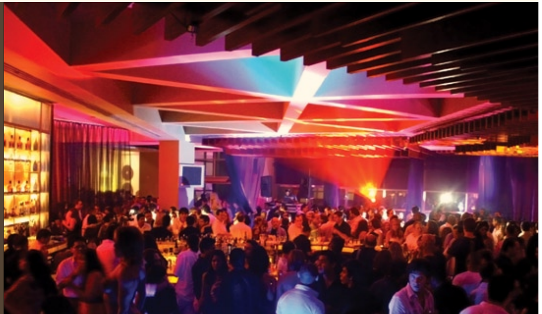
Rose Bar - Gerber Group

One, Two, Free... A third guest in your room at no extra charge.